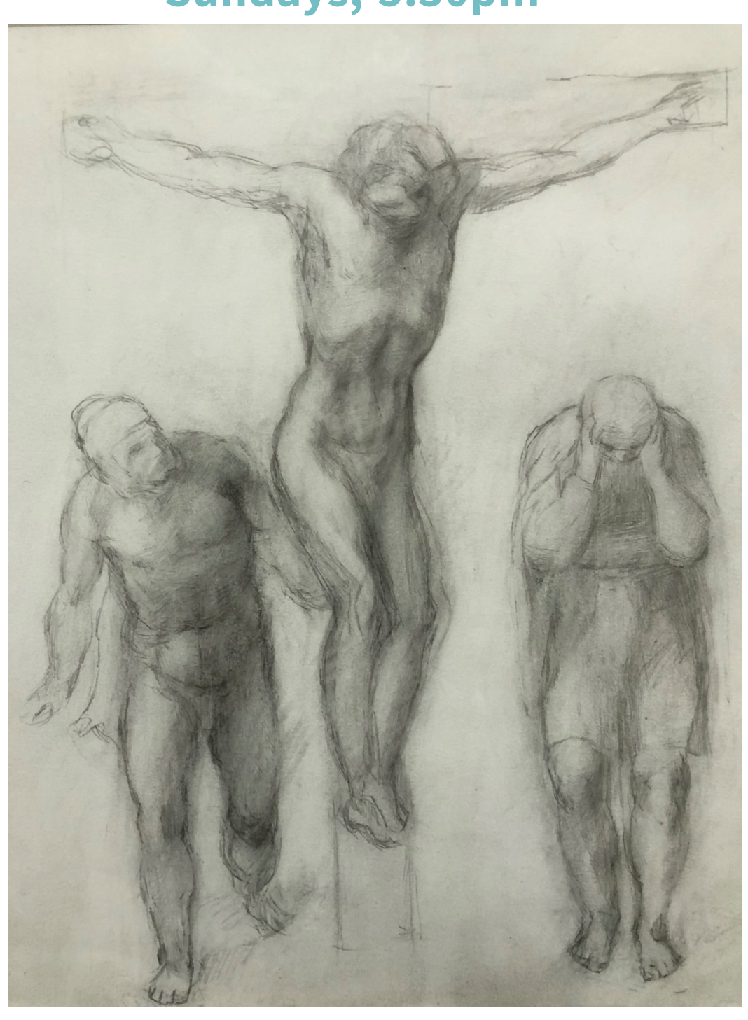
Memory and Identity - It's all History Now