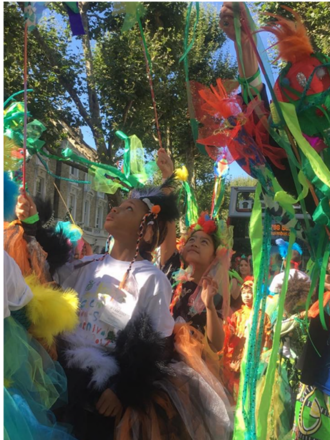
Carnival Mass at Clement James Centre In the shadow of Grenfell Tower