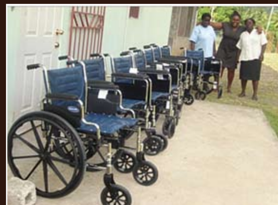
WHEELCHAIRS FOR A HOME FOR THE ELDERLY IN ST LUCIA