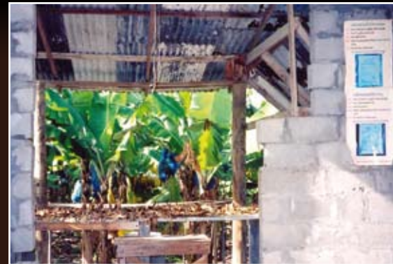
FAIRTRADE GUIDELINES KEEP STANDARDS HIGH, SEE TOP RIGHT