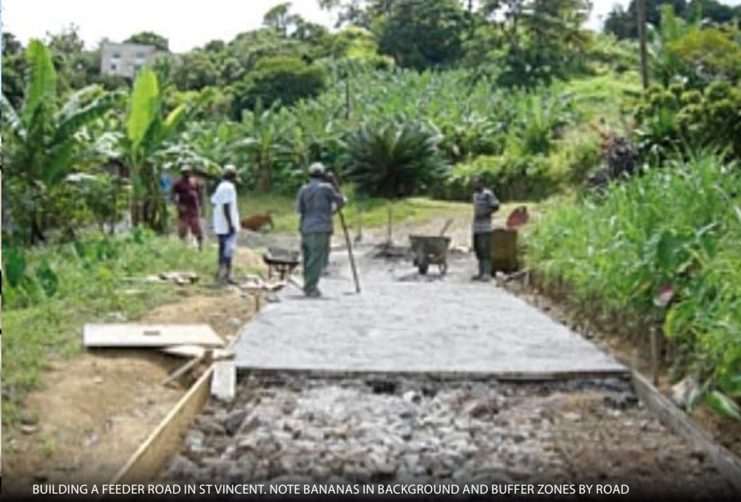
BUILDING A FEEDER ROAD IN ST VINCENT. NOTE BANANAS IN BACKGROUND AND BUFFER ZONES BY ROAD