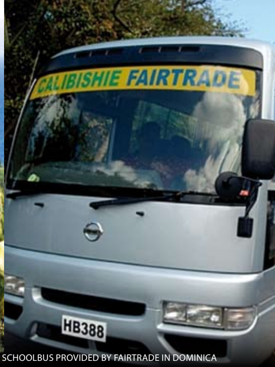
SCHOOLBUS PROVIDED BY FAIRTRADE IN DOMINICA