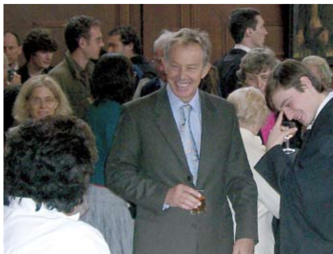
BIG DEGREE DAY 27TH SEPTEMBER 2007

Relatives and family friends joined the LMH 2007 graduands on the 27 September 2007 at a celebratory lunch in College prior to the graduation ceremonies taking place in the afternoon. The following day it was the turn of the year group of 2000 to return, reunite and scratch their heads over the rapid passing of twenty-one terms after their matriculation; the point at which all undergraduates of BA degrees are eligible to claim the MA degree from the University. Alumni, friends and relatives gathered in Talbot Hall. Afterwards, the class of 2000 unwound in a reception in the Old Library before continuing their celebrations in town.