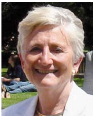
PAULINE NEVILLE JONES

Pauline Neville Jones DCMG (1958 History), Honorary Fellow, has been made Baroness Neville Jones DCMG of Hutton Roof in the County of Cumbria. She is currently Shadow Security Minister and National Security Adviser to David Cameron and appears frequently on TV and radio.