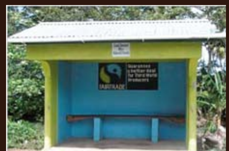
PROJECTS FUNDED BY THE SOCIAL PREMIUM

Britain is the biggest national market for Fairtrade goods in the world. The total retail value of Fairtrade products grew from £2.75million in 1993 to over £290million in 2006 with bananas being second only to coffee in value and the leader by volume. The Co-operative