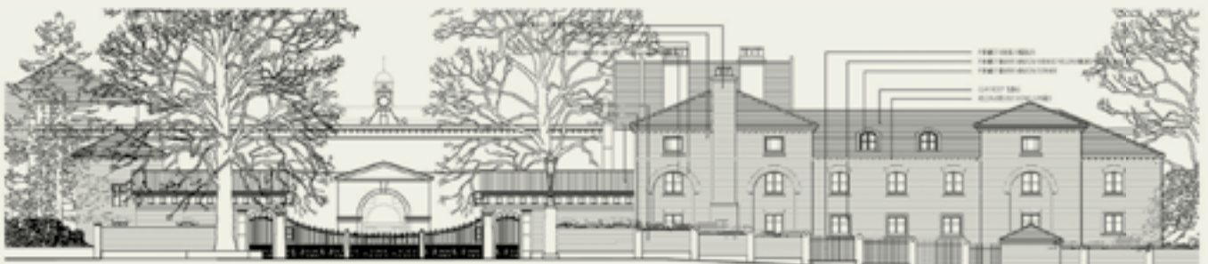
Architect's drawing of new front of College and Graduate Centre

So we have developed a "Three-Pillar Strategy" for fundraising over the next five years: student support, teaching and research, and new buildings. The newly launched Annual Fund is progressing very well, with £70k raised in the first few weeks. It is aimed especially at supporting students and teaching. We are also making good progress towards the next phase of the new building project. Thanks to gifts from the Clore Duffield Foundation and other donors, £2.4m has been raised already towards the £7.0m needed. Finally, we will work to establish permanent funding for crucial teaching and research posts.